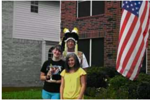
Our Second Place Trophy!!!