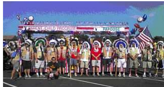
The most Headdresses ever!!!!!!

Our next event is the Carnival on August 29th, same place as before (behind the Central YMCA). We are in charge of the Rope Bridge. We will start the set up on Friday evening the 28th at 5:00 PM. Please let me know if you can help with set up or manning the bridge during the Carnival.