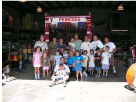
The Decorating Crew!!