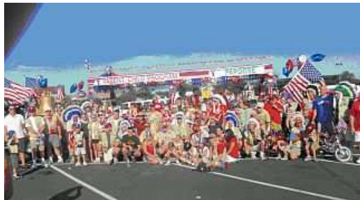
The largest group in five years!!!!